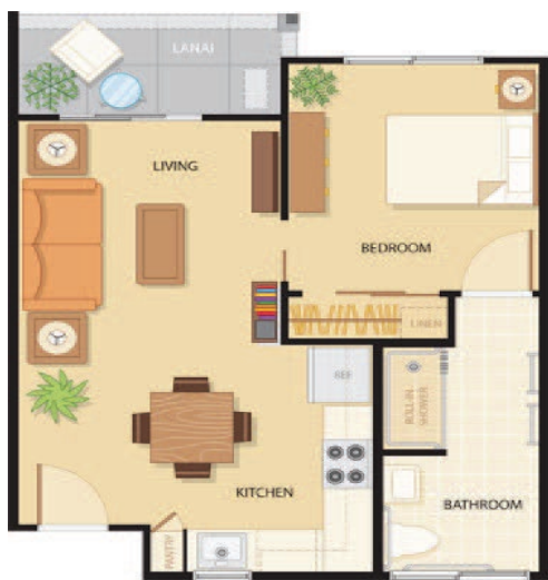
UNIT A 1 BEDROOM, 1 BATH