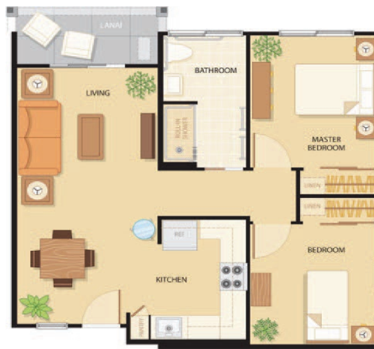
UNIT B 2 BEDROOMS, 1 BATH

91-1471 Miula St., Ste. 7000 Ewa, Beach, HI 96706 www.franciscanvistasewa.com